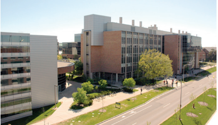
Figure 1: Example of a figure inclusion for a nuclear chemistry seminar abstract. Font for figure caption is 12 pt.

This seminar will cover the background of the general alkylation reactions by organozinc reagents and will introduce the search and the discovery of asymmetric autocatalytic systems.