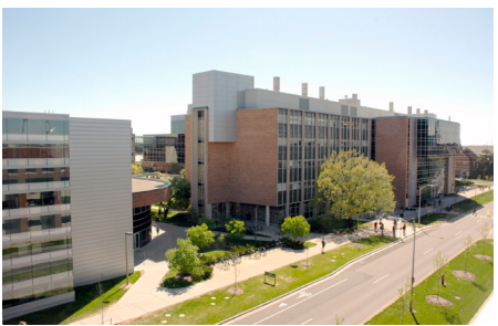
Figure 1: Example of a figure inclusion for a nuclear chemistry seminar abstract. Font for figure caption is 12 pt.

The abstract should start with the title "Nuclear Chemistry Seminar" centered in 12 pt. font at the top of the page. The next line should be the title, in 14 pt. Bold font, again centered. The student's name comes next, with identical font and centering as title. The date, time, and location all follow, on separate lines, below the student's name. Each should be in 12 pt. font and centered. The body of the abstract should be 12 pt. font, single spaced. The abstract body should be a single paragraph. References should be included as [1]. If a figure is included, it should have a descriptive caption, and be properly referenced in the abstract. For example, an image of this abstract is presented in Fig. 1. The completed abstract should fit on a single 8.5" x 11" page with 1" margins on all edges.