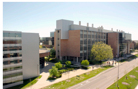
Figure 1: Example of a figure inclusion for a nuclear chemistry seminar abstract. Font for figure caption is 12 pt.

Although preparing for your seminar entails collecting and reading many published articles, the purpose of your presentation is not to present a “book report”. Instead, you are required to relate the papers, discuss the evolution of the work, and critically evaluate the work. Tell what may be missing from each research finding and how the overall thinking or models have changed with time and experiments. Give the important contributions of each group of results, and discuss what improvements could be made in the studies. Point out differences of opinion between authors; don't hesitate to express your own opinions on the subject, but be prepared to explain how you came to these views. Discuss the directions that can be taken for future research in this area. You are teaching your audience a subject of current interest in organic chemistry. Take intellectual control of the subject material.